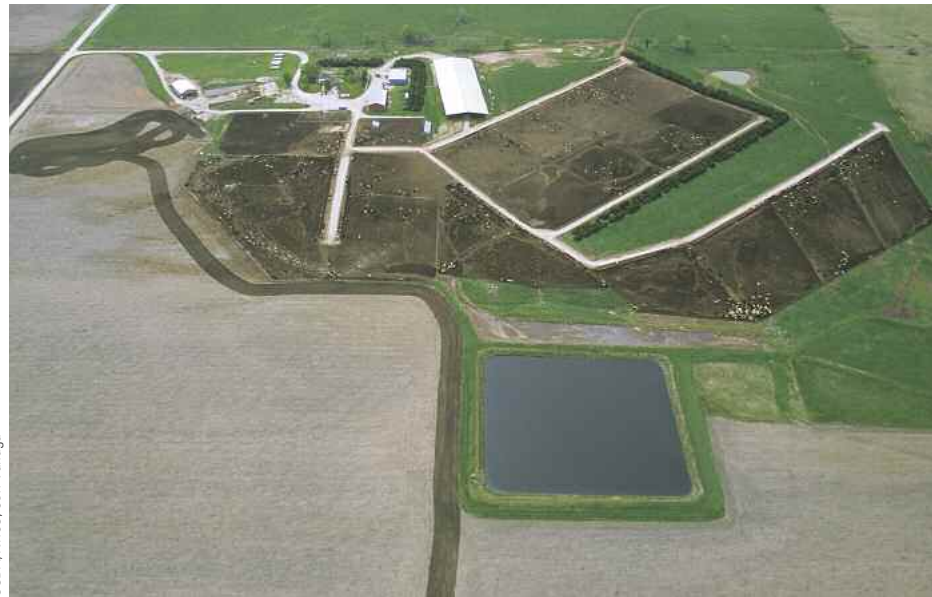
A Kansas feedlot operation with waste management lagoon in the foreground.

is by destroying natural forest. Growth in markets for livestock products is greatest in developing countries, where rainforest normally stores at least 200 tons of carbon per hectare. Where forest is replaced by moderately degraded grassland, the tonnage of carbon stored per hectare is reduced to 8.