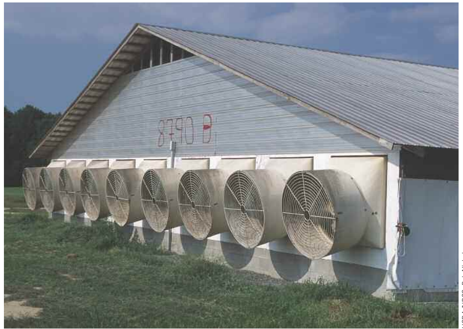
Adding more to the carbon footprint: large fans keep pigs cool in North Carolina.

Finally, we believe that FAO has overlooked some emis-