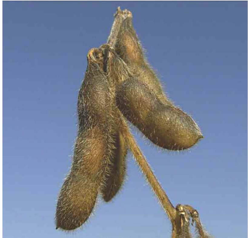
The mighty analog: soybeans await harvest on a Maryland farm.

ment projects in developing countries. If those standards were to frown upon investments in large-scale livestock projects, then a company with a meat or dairy analog project would be well positioned to attract investments.